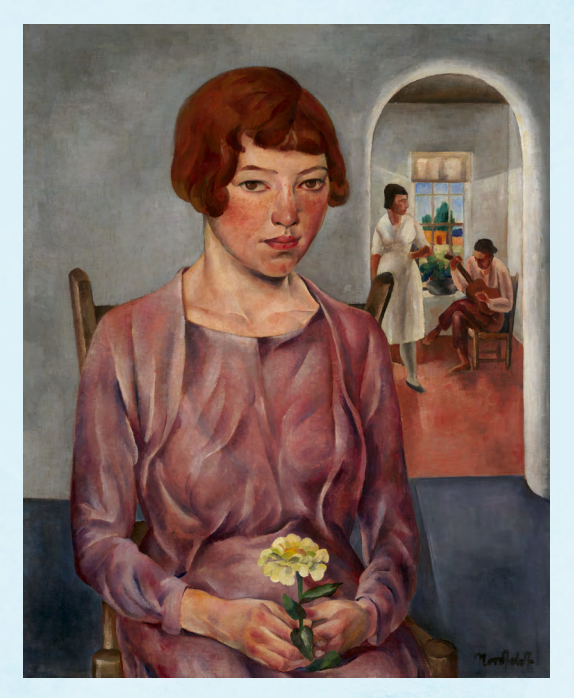
B.J.O. Nordfeldt, Girl Holding a Flower , about 1934. Oil on canvas, 31 3/4 x 25 3/4 inches. Wichita Public Schools, on long-term loan to the Wichita Art Museum