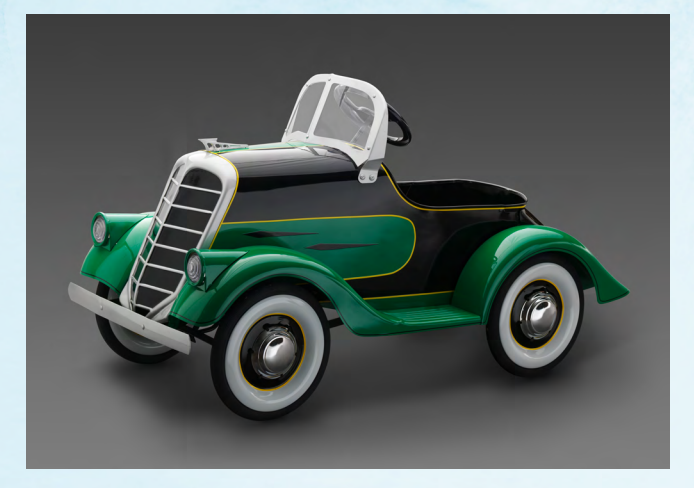
Pedal Car , 1930s. Metal, 25 x 21 x 44 inches, Marshall V. Miller Collection

Art Deco is a wildly popular design movement from the 1920s and 1930s—the Roaring Twenties and Great Depression. WAM will present an exhibition of 140+ iconic artworks—decorative arts, paintings, sculptures, and more—that epitomize this historical moment in American experience. American Art Deco investigates the dynamic period when the country went through sharp economic, political, and social as well as