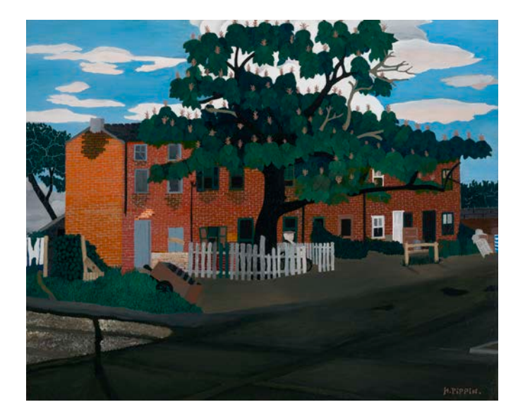
Horace Pippin, West Chester, Pennsylvania , 1942. Oil on canvas, 29 3/8 x 36 3/8 inches. Wichita Art Museum, Roland P. Murdock Collection

GO FIND! Look for these paintings in the Storytelling exhibition upstairs at WAM: